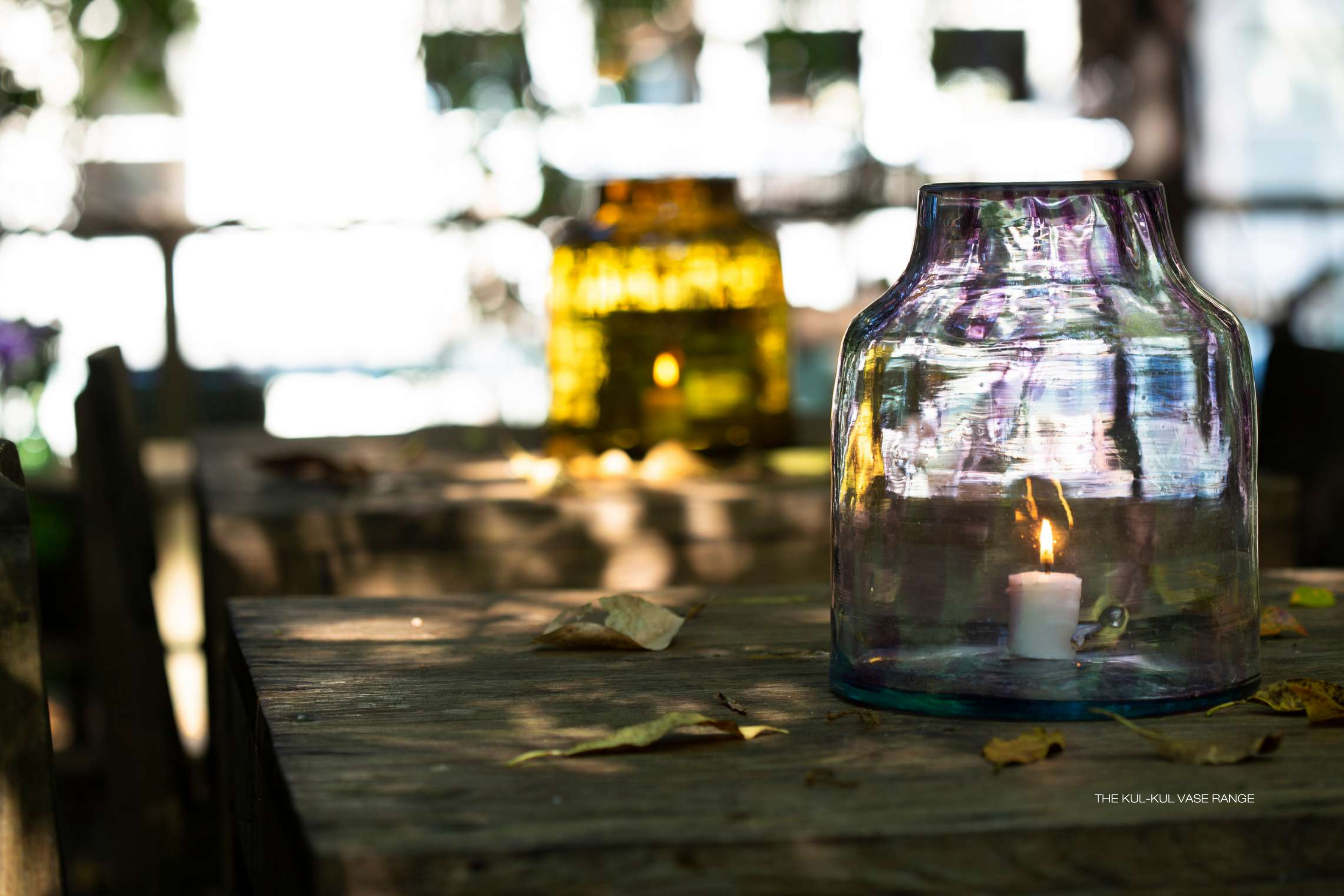
THE KUL-KUL VASE RANGE