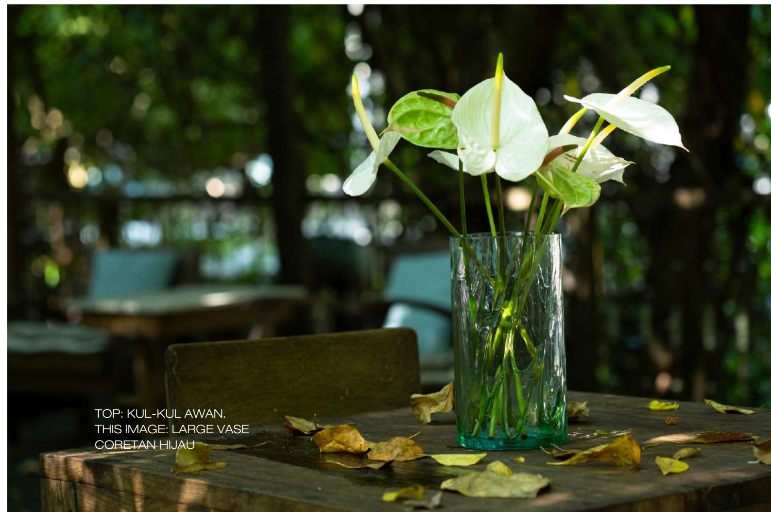
TOP: KUL-KUL AWAN. THIS IMAGE: LARGE VASE CORETAN HIJAU