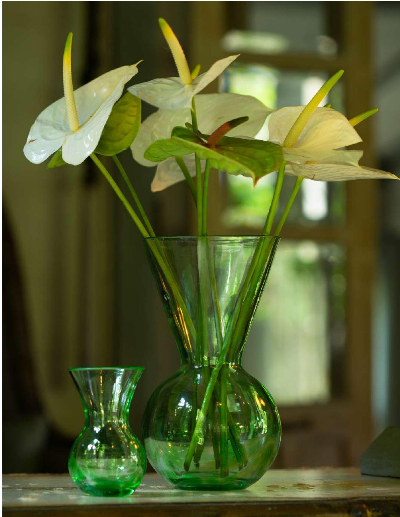
BUD VASE & HOURGLASS.