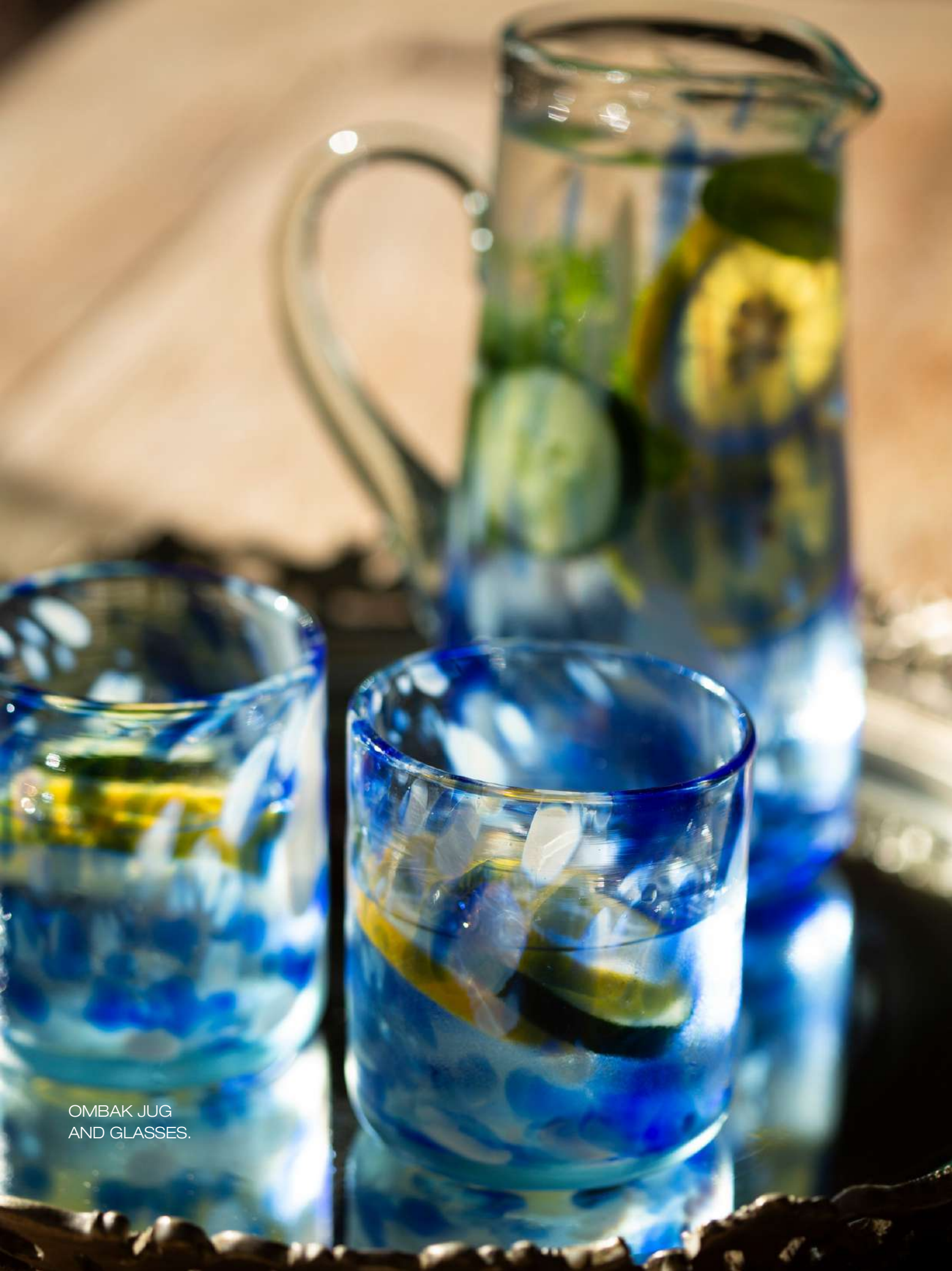
OMBAK JUG AND GLASSES.