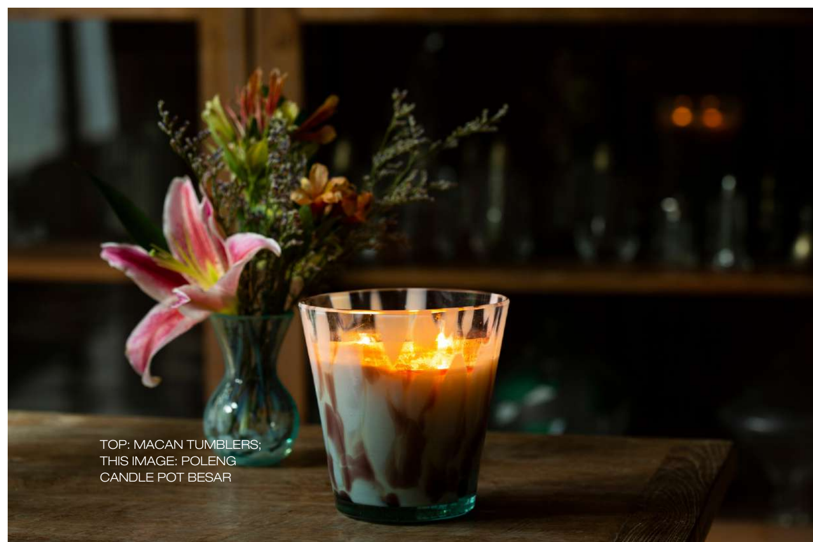
TOP: MACAN TUMBLERS; THIS IMAGE: POLENG CANDLE POT BESAR