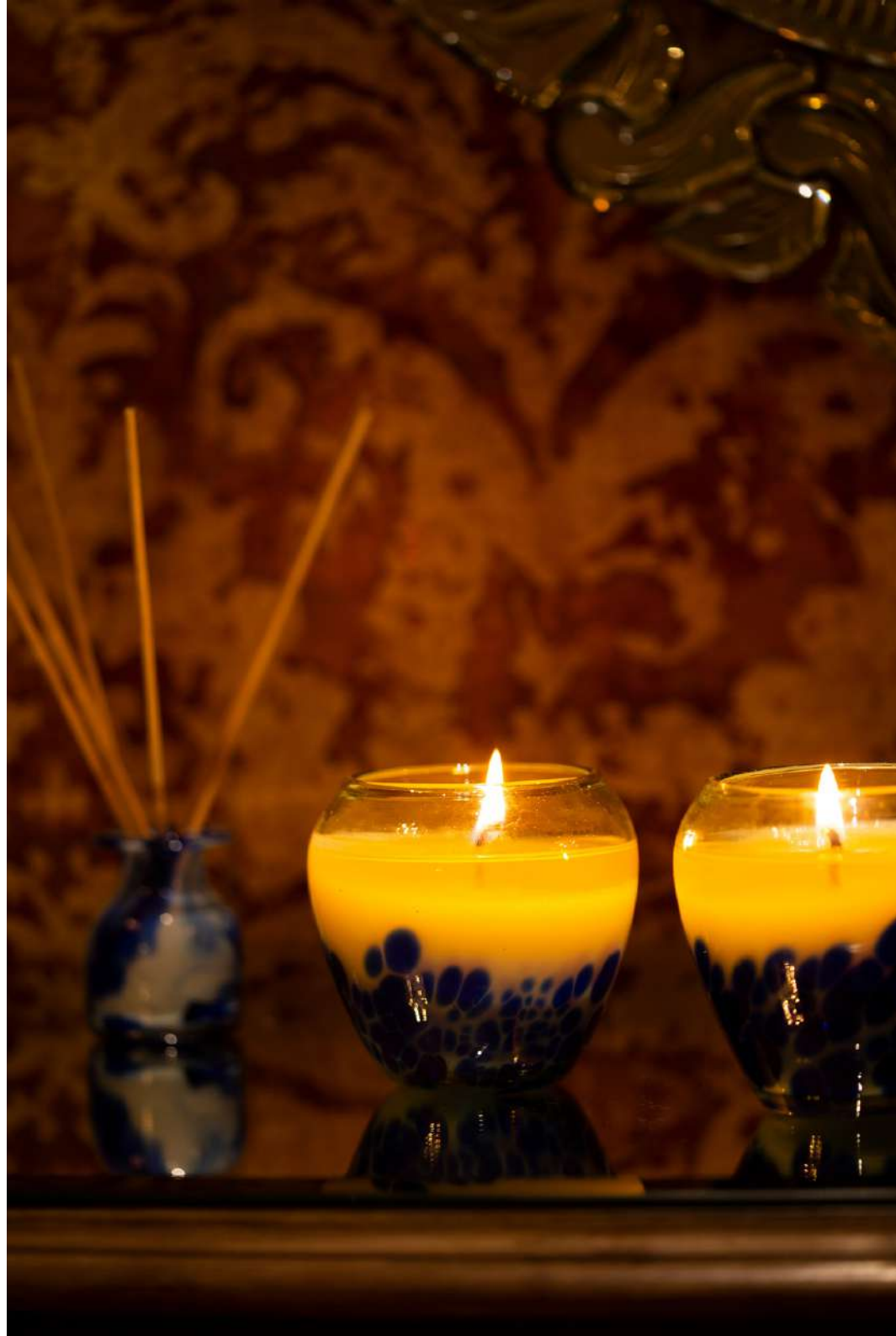
LAUT BOWL CANDLES.