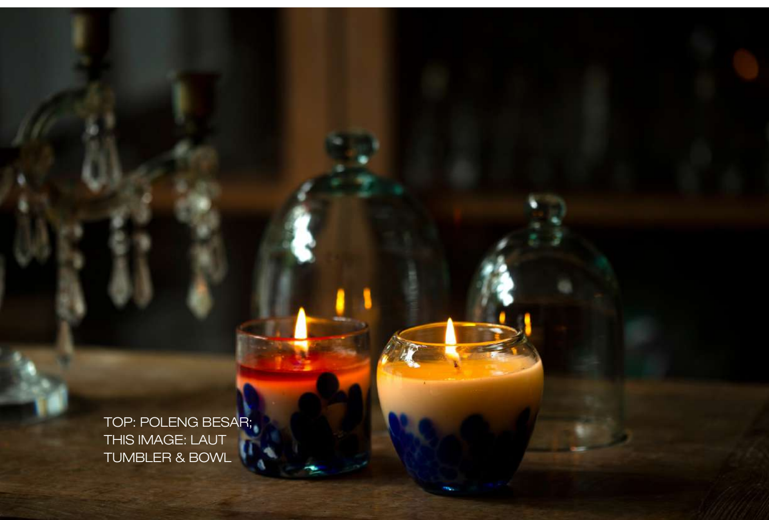
TOP: POLENG BESAR; THIS IMAGE: LAUT TUMBLER & BOWL