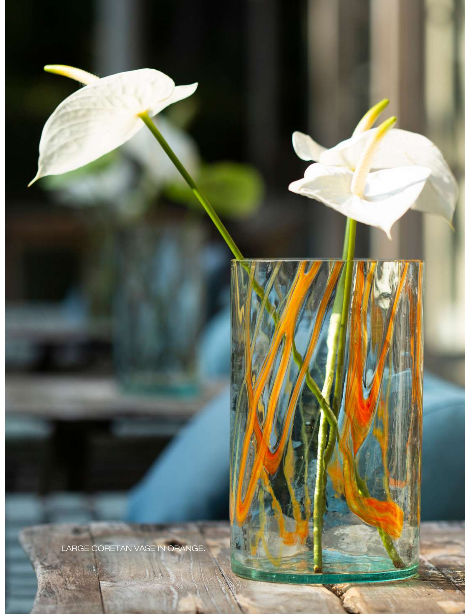
LARGE CORETAN VASE IN ORANGE.