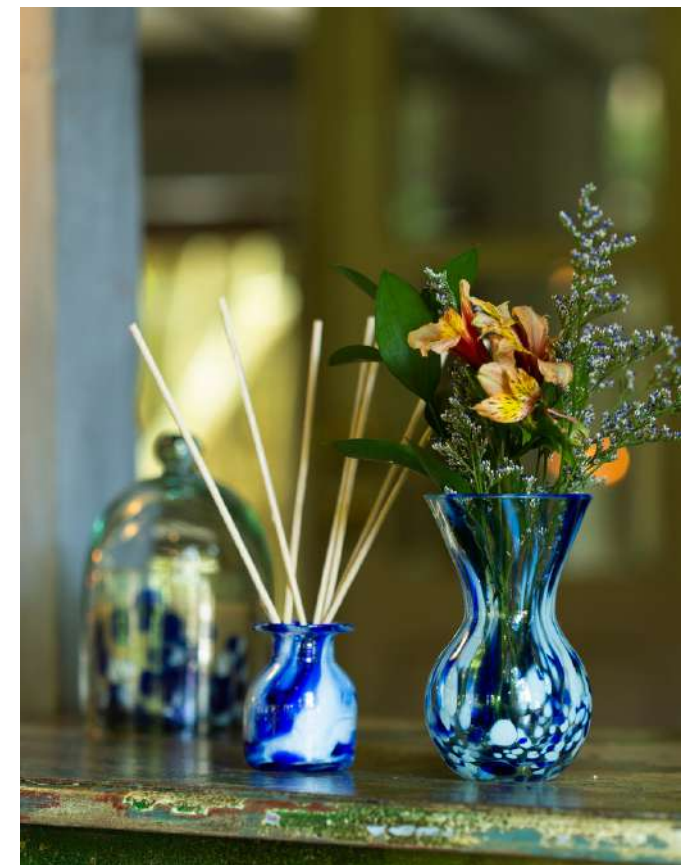
CLOCKWISE FROM TOP LEFT: AWAN GLASS JUG AND GLASS SET; HIJAU JUG AND GLASS SET; MADU RANGE; CANDLE DOME, OMBAK REED DIFFUSER, OMBAK BUD VASE.